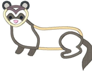
Ferret Applique 145.vp3 5.71x4.31 inches; 8,984 stitches 12 thread changes; 12 colors