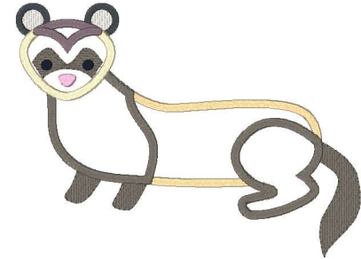
Ferret Applique 170.vp3 6.67x4.91 inches; 10,654 stitches 12 thread changes; 12 colors