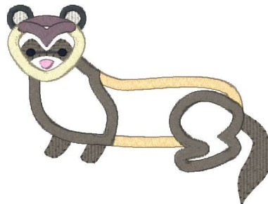
Ferret Applique 95.vp3 3.74x2.83 inches; 5,699 stitches 12 thread changes; 12 colors