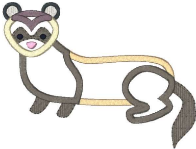
Ferret Applique 120.vp3 4.72x3.57 inches; 7,203 stitches 12 thread changes; 12 colors