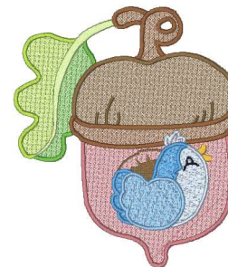
Fsl Birds & Acorns 01 - 5x7.vip 4.89x5.74 inches; 19,320 stitches 14 thread changes; 12 colors