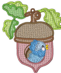
Fsl Birds & Acorns 05 - 4x4.vip 3.27x3.93 inches; 11,841 stitches 15 thread changes; 13 colors