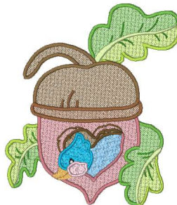
Fsl Birds & Acorns 03 - 5x7.vip 4.85x5.61 inches; 19,093 stitches 16 thread changes; 14 colors