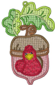
Fsl Birds & Acorns 04 - 4x4.vip 2.47x3.92 inches; 10,501 stitches 13 thread changes; 12 colors