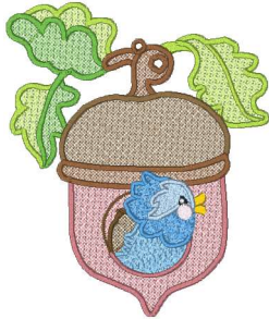
Fsl Birds & Acorns 05 - 5x7.vip 4.39x5.24 inches; 17,461 stitches 15 thread changes; 13 colors