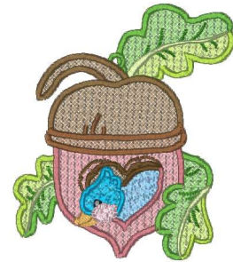
Fsl Birds & Acorns 03 - 4x4.vip 3.22x3.72 inches; 11,298 stitches 16 thread changes; 14 colors