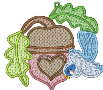
Fsl Birds & Acorns 06 - 4x4.vip 3.93x3.50 inches; 14,840 stitches 16 thread changes; 14 colors