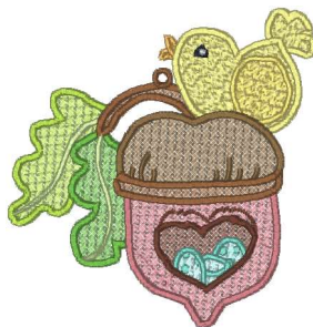
Fsl Birds & Acorns 08- 4x4.vip 3.78x3.93 inches; 13,621 stitches 17 thread changes; 14 colors