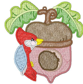
Fsl Birds & Acorns 07 - 5x7.vip 4.71x4.92 inches; 20,369 stitches 19 thread changes; 16 colors