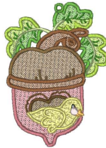
Fsl Birds & Acorns 02 - 4x4.vip 2.67x3.69 inches; 10,736 stitches 14 thread changes; 13 colors