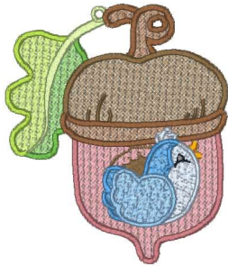
Fsl Birds & Acorns 01 - 4x4.vip 3.36x3.94 inches; 11,643 stitches 14 thread changes; 12 colors