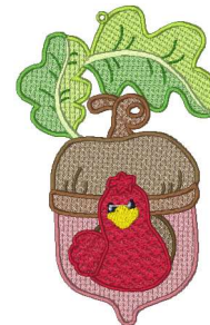
Fsl Birds & Acorns 04 - 5x7.vip 4.32x6.82 inches; 21,491 stitches 13 thread changes; 12 colors