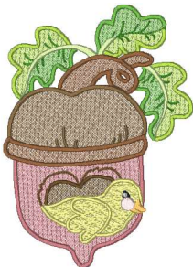
Fsl Birds & Acorns 02 - 5x7.vip 4.34x6.06 inches; 20,120 stitches 14 thread changes; 13 colors