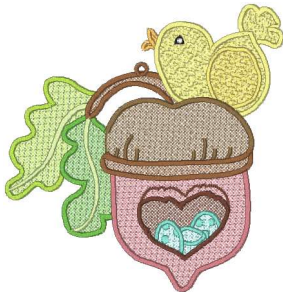
Fsl Birds & Acorns 08- 5x7.vip 4.97x5.16 inches; 19,643 stitches 17 thread changes; 14 colors