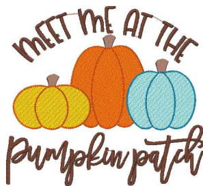
Bc_fallsayingsfour8_6x10.vip 5.81x6.40 inches; 23,350 stitches 7 thread changes; 7 colors