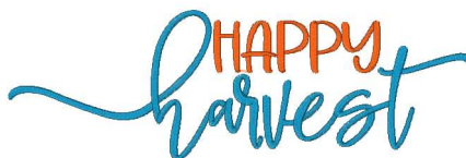
Bc_fallsayingsfour11_8x8.vip 7.76x2.50 inches; 5,770 stitches 2 thread changes; 2 colors