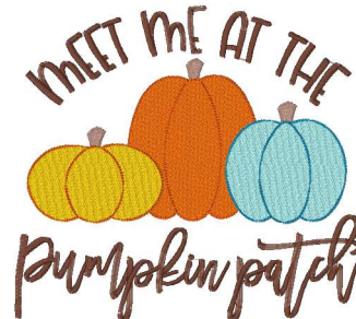
Bc_fallsayingsfour8_8x8.vip 7.77x7.06 inches; 31,560 stitches 7 thread changes; 7 colors