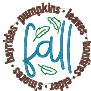
Bc_fallsayingsfour1_4x4.vip 3.82x3.79 inches; 7,976 stitches 4 thread changes; 4 colors