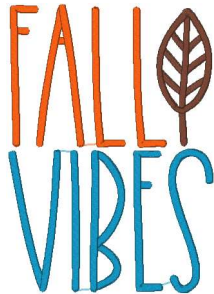
Bc_fallsayingsfour2_5x7.vip 4.81x6.80 inches; 12,761 stitches 3 thread changes; 3 colors