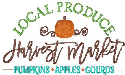
Bc_fallsayingsfour10_12x8.vip 11.80x7.01 inches; 30,424 stitches 5 thread changes; 5 colors