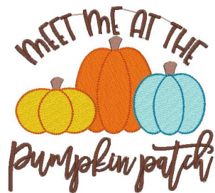
Bc_fallsayingsfour8_5x7.vip 4.81x5.30 inches; 17,700 stitches 7 thread changes; 7 colors