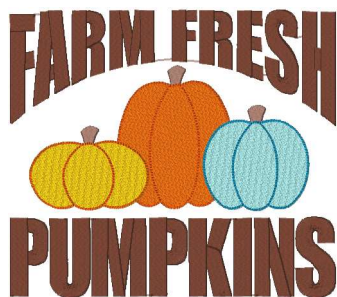
Bc_fallsayingsfour7_8x8.vip 7.77x6.86 inches; 37,776 stitches 7 thread changes; 7 colors