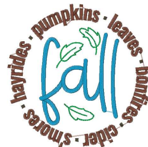
Bc_fallsayingsfour1_5x7.vip 4.80x4.76 inches; 9,941 stitches 4 thread changes; 4 colors