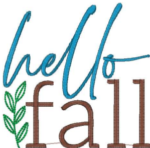
Bc_fallsayingsfour4_4x4.vip 3.83x3.74 inches; 5,432 stitches 3 thread changes; 3 colors