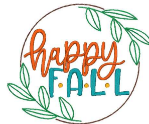
Bc_fallsayingsfour3_6x10.vip 5.81x7.07 inches; 12,172 stitches 5 thread changes; 5 colors