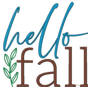
Bc_fallsayingsfour4_5x7.vip 4.81x4.70 inches; 7,656 stitches 3 thread changes; 3 colors