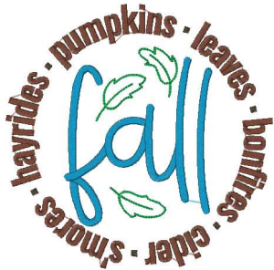
Bc_fallsayingsfour1_6x10.vip 5.80x5.76 inches; 12,643 stitches 4 thread changes; 4 colors