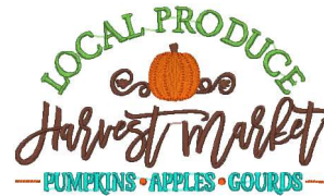
Bc_fallsayingsfour10_5x7.vip 4.04x6.80 inches; 14,439 stitches 5 thread changes; 5 colors