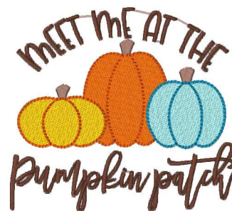
Bc_fallsayingsfour8_4x4.vip 3.83x3.48 inches; 11,362 stitches 7 thread changes; 7 colors