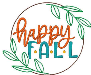
Bc_fallsayingsfour3_5x7.vip 4.81x5.85 inches; 9,727 stitches 5 thread changes; 5 colors