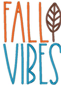
Bc_fallsayingsfour2_6x10.vip 5.81x8.22 inches; 17,046 stitches 3 thread changes; 3 colors