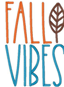
Bc_fallsayingsfour2_8x8.vip 5.49x7.76 inches; 15,762 stitches 3 thread changes; 3 colors