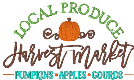
Bc_fallsayingsfour10_8x8.vip 7.76x4.61 inches; 16,862 stitches 5 thread changes; 5 colors