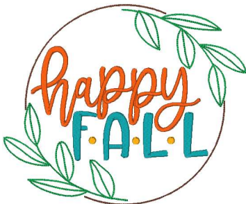
Bc_fallsayingsfour3_8x8.vip 7.76x6.38 inches; 14,314 stitches 5 thread changes; 5 colors