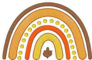
Bc_fallsayingsfour12_5x7.vip 4.41x6.81 inches; 11,813 stitches 4 thread changes; 4 colors