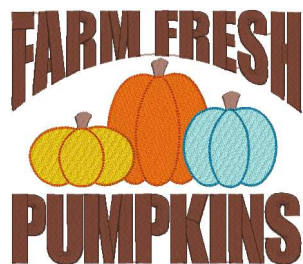
Bc_fallsayingsfour7_6x10.vip 5.81x6.59 inches; 29,359 stitches 7 thread changes; 7 colors