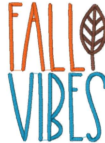
Bc_fallsayingsfour2_4x4.vip 2.71x3.82 inches; 5,232 stitches 3 thread changes; 3 colors