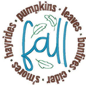
Bc_fallsayingsfour1_8x8.vip 7.76x7.70 inches; 19,558 stitches 4 thread changes; 4 colors