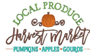
Bc_fallsayingsfour10_6x10.vip 5.81x9.79 inches; 22,847 stitches 5 thread changes; 5 colors