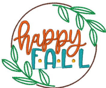
Bc_fallsayingsfour3_4x4.vip 3.83x3.15 inches; 6,072 stitches 5 thread changes; 5 colors