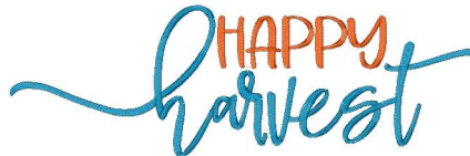
Bc_fallsayingsfour11_12x8.vip 11.81x3.80 inches; 11,423 stitches 2 thread changes; 2 colors