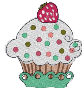
Sfteallace6x8.vip 5.90x6.36 inches; 28,190 stitches 10 thread changes; 10 colors