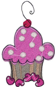
Sfsinglecherry4x4.vip 2.42x3.94 inches; 9,203 stitches 9 thread changes; 9 colors