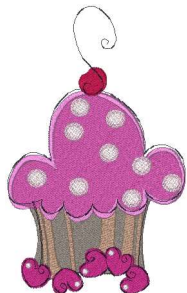
Sfsinglecherry6x8.vip 4.82x7.86 inches; 23,639 stitches 9 thread changes; 9 colors