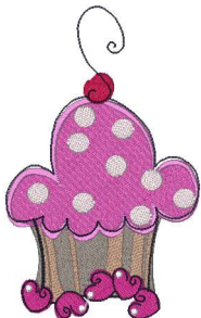
Sfsinglecherry5x7.vip 4.22x6.88 inches; 19,444 stitches 9 thread changes; 9 colors