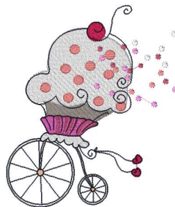
Sfpinkbike6x8.vip 5.89x6.89 inches; 17,528 stitches 9 thread changes; 9 colors