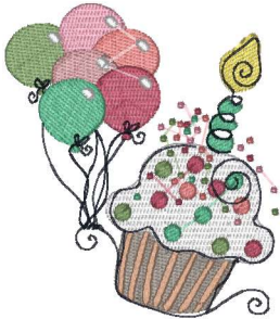
Sfmultiballooncupcake4x4.vip 3.44x3.93 inches; 12,500 stitches 12 thread changes; 11 colors