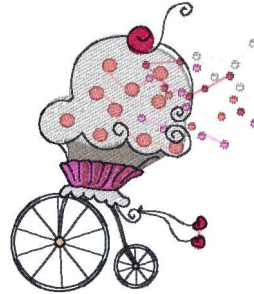
Sfpinkbike4x4.vip 3.36x3.93 inches; 8,860 stitches 9 thread changes; 9 colors