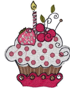
Sfredlace4x4.vip 3.09x3.93 inches; 13,504 stitches 11 thread changes; 10 colors