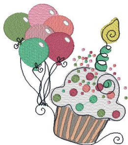
Sfmultiballooncupcake6x8.vip 5.89x6.75 inches; 25,465 stitches 12 thread changes; 11 colors