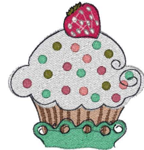
Sfteallace4x4.vip 3.65x3.94 inches; 14,109 stitches 10 thread changes; 10 colors