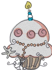
Sfsummercupcake5x7.vip 5.00x6.67 inches; 22,385 stitches 11 thread changes; 11 colors