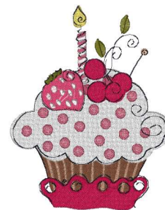
Sfredlace6x8.vip 5.91x7.52 inches; 31,834 stitches 11 thread changes; 10 colors