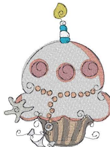
Sfsummercupcake6x8.vip 5.89x7.86 inches; 28,908 stitches 11 thread changes; 11 colors