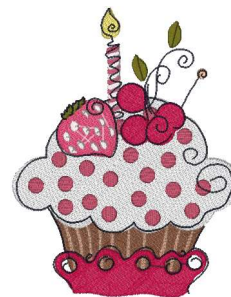
Sfredlace5x7.vip 5.00x6.37 inches; 25,195 stitches 11 thread changes; 10 colors