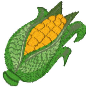
Corn 18012024 50 Mm.vip 1.86x1.85 inches; 4,814 stitches 4 thread changes; 4 colors