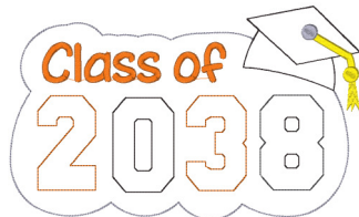
Ca-Bean Class Of 2038-9in.vip 8.71x5.28 inches; 9,639 stitches 14 thread changes; 6 colors