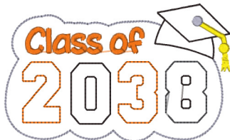
Ca-Bean Class Of 2038-5in.vip 4.71x2.86 inches; 5,322 stitches 14 thread changes; 6 colors