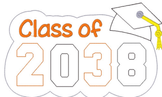
Ca-Bean Class Of 2038-12in.vip 11.41x6.92 inches; 12,574 stitches 14 thread changes; 6 colors