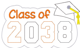
Ca-Bean Class Of 2038-11in.vip 10.71x6.50 inches; 11,810 stitches 14 thread changes; 6 colors