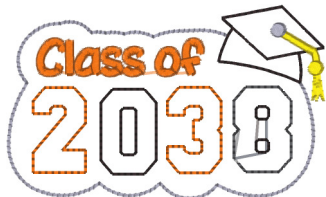
Ca-Bean Class Of 2038-4in.vip 3.71x2.25 inches; 4,316 stitches 14 thread changes; 6 colors