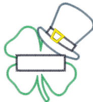
Shamrock With Hat And Name - Zig Zag - Ata - 8x8.vip 6.65x7.38 inches; 5,102 stitches 13 thread changes; 6 colors