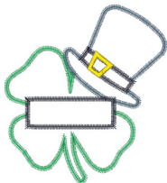
Shamrock With Hat And Name - Zig Zag - Ata - 6x10.vip 5.86x6.50 inches; 4,530 stitches 13 thread changes; 6 colors