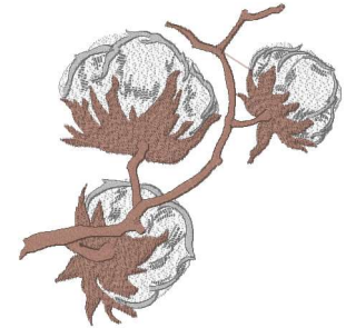
Cotton Branch 19032024 5 Inch.vip 4.93x4.92 inches; 18,725 stitches 3 thread changes; 3 colors