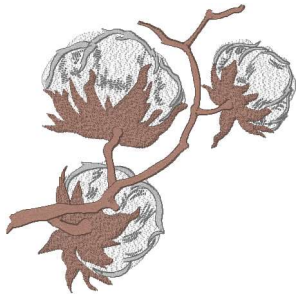
Cotton Branch 19032024 6 Inch.vip 5.79x5.79 inches; 23,546 stitches 3 thread changes; 3 colors