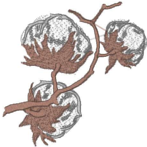
Cotton Branch 19032024 3 Inch.vip 2.96x2.95 inches; 9,577 stitches 3 thread changes; 3 colors