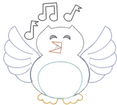
9x9 Vintage Singing Owl 2.vip 7.50x6.71 inches; 5,658 stitches 19 thread changes; 9 colors