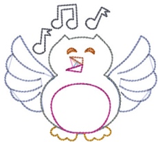
4x4 Vintage Singing Owl 2.vip 3.87x3.46 inches; 3,271 stitches 20 thread changes; 10 colors