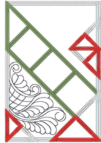
Design 3.vip 4.89x7.24 inches; 20,551 stitches 24 thread changes; 7 colors