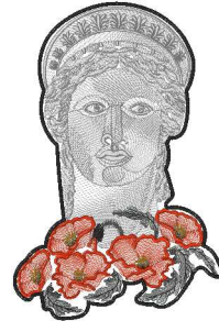
Hera 320 .vp3

7.31x11.04 inches; 50,055 stitches 12 thread changes; 8 colors