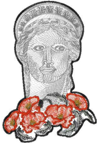
Hera 200 .vp3

5.17x7.81 inches; 33,254 stitches 12 thread changes; 8 colors