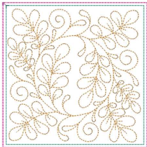
Circle-Of-Leaves-Block4-5x5.vip 5.10x5.10 inches; 4,744 stitches 4 thread changes; 3 colors