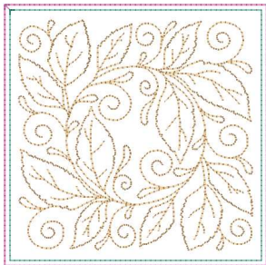
Circle-Of-Leaves-Block12-5x5.vip 5.09x5.09 inches; 4,808 stitches 4 thread changes; 3 colors