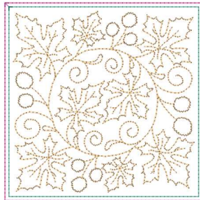
Circle-Of-Leaves-Block8-5x5.vip 5.10x5.10 inches; 5,452 stitches 4 thread changes; 3 colors