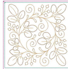
Circle-Of-Leaves-Block9-5x5.vip 5.10x5.10 inches; 5,129 stitches 4 thread changes; 3 colors