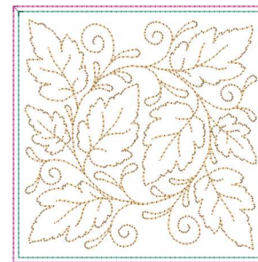
Circle-Of-Leaves-Block11-5x5.vip 5.10x5.10 inches; 4,270 stitches 4 thread changes; 3 colors