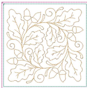
Circle-Of-Leaves-Block10-5x5.vip 5.10x5.10 inches; 3,983 stitches 4 thread changes; 3 colors