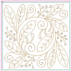
Circle-Of-Leaves-Block7-5x5.vip 5.10x5.10 inches; 4,365 stitches 4 thread changes; 3 colors