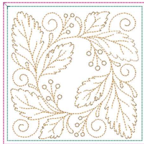
Circle-Of-Leaves-Block2-5x5.vip 5.10x5.10 inches; 4,456 stitches 4 thread changes; 3 colors