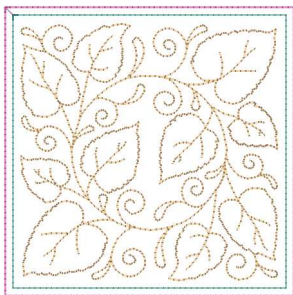
Circle-Of-Leaves-Block1-5x5.vip 5.10x5.10 inches; 4,186 stitches 4 thread changes; 3 colors