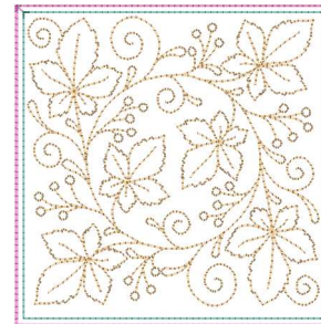
Circle-Of-Leaves-Block6-5x5.vip 5.10x5.10 inches; 5,137 stitches 4 thread changes; 3 colors