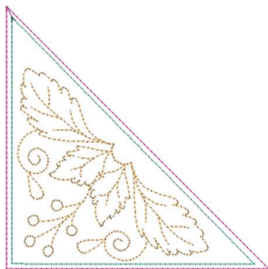
Circle-Of-Leaves-Triangle-Block-5x5.vip 5.10x5.10 inches; 2,041 stitches 4 thread changes; 3 colors