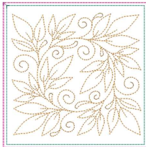
Circle-Of-Leaves-Block5-5x5.vip 5.10x5.10 inches; 3,643 stitches 4 thread changes; 3 colors