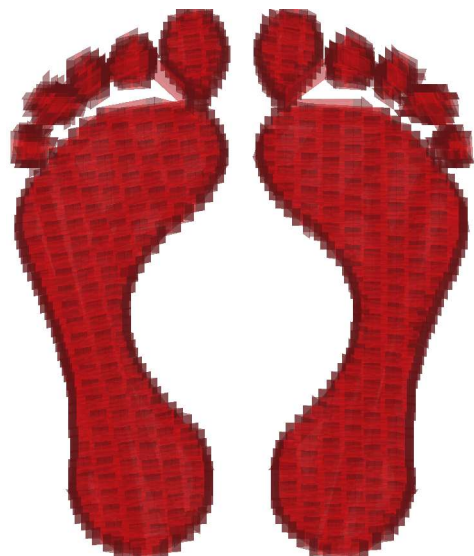
1 Inch.vip 0.83x1.00 inches; 1,160 stitches 1 thread changes; 1 colors