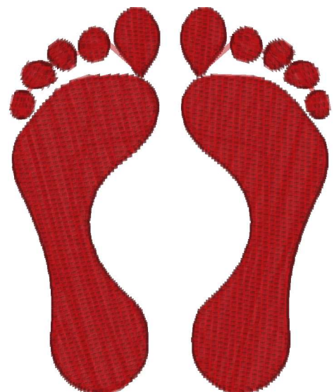
2.5 Inch.vip 2.06x2.50 inches; 3,978 stitches 1 thread changes; 1 colors