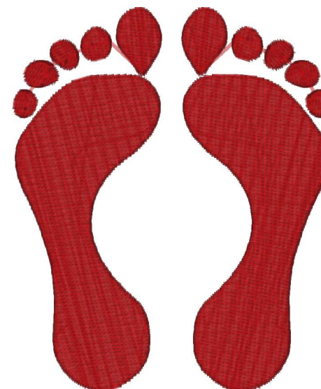
3.5 Inch.vip 2.89x3.50 inches; 6,801 stitches 1 thread changes; 1 colors