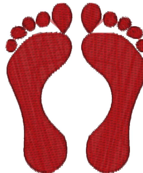
2 Inch.vip 1.65x2.00 inches; 2,869 stitches 1 thread changes; 1 colors