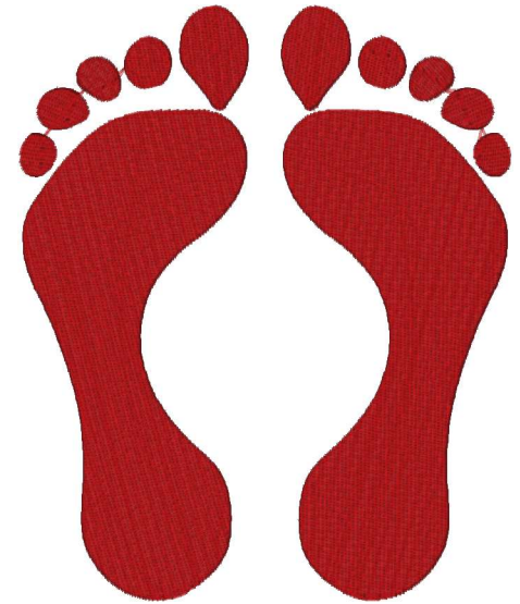
5 Inch.vip 5.00x6.06 inches; 17,428 stitches 1 thread changes; 1 colors