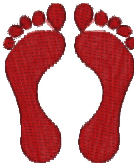
1.5 Inch.vip 1.24x1.50 inches; 1,938 stitches 1 thread changes; 1 colors