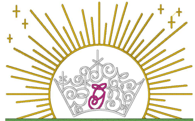
Deco Split Tiara 170.vp3 6.69x6.05 inches; 24,372 stitches 5 thread changes; 4 colors