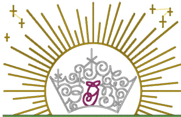
Deco Split Tiara 145.vp3 5.71x5.16 inches; 21,083 stitches 5 thread changes; 4 colors