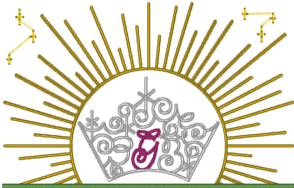
Deco Split Tiara 120.vp3 4.72x4.28 inches; 17,180 stitches 5 thread changes; 4 colors