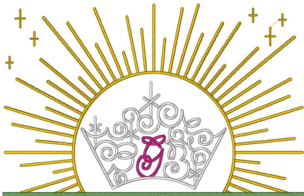
Deco Split Tiara 195.vp3 7.68x6.92 inches; 27,815 stitches 5 thread changes; 4 colors