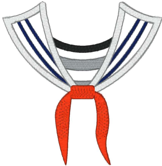
Sailor Uniform 95.vp3 3.68x3.74 inches; 6,426 stitches 9 thread changes; 9 colors