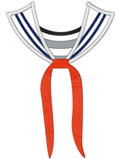
Sailor Uniform 175.vp3 4.81x6.89 inches; 10,744 stitches 9 thread changes; 9 colors