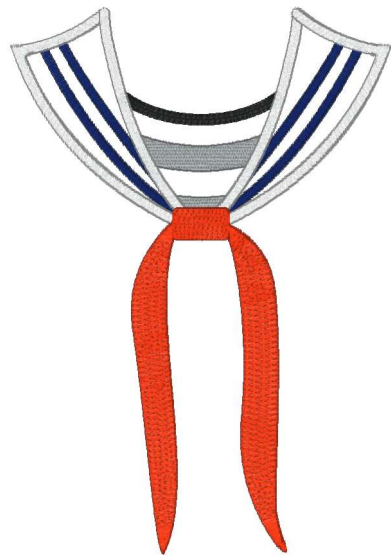
Sailor Uniform 195 Long.vp3 5.35x7.68 inches; 12,357 stitches 9 thread changes; 9 colors