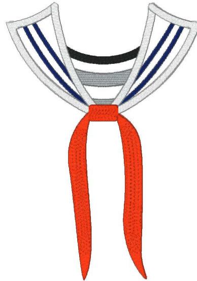
Sailor Uniform 145.vp3 4.02x5.71 inches; 8,370 stitches 9 thread changes; 9 colors