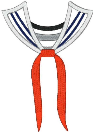
Sailor Uniform 120.vp3 3.35x4.72 inches; 6,675 stitches 9 thread changes; 9 colors