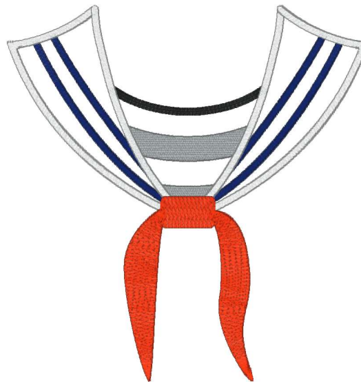
Sailor Uniform 195 Short.vp3 7.40x7.68 inches; 15,555 stitches 9 thread changes; 9 colors