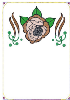
Outer Part With Rose 140x200.vip 5.47x7.85 inches; 10,458 stitches 12 thread changes; 9 colors