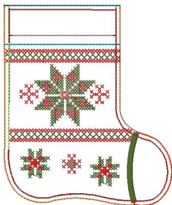
Omacmascstocking1.vip 5.00x6.00 inches; 12,696 stitches 12 thread changes; 10 colors