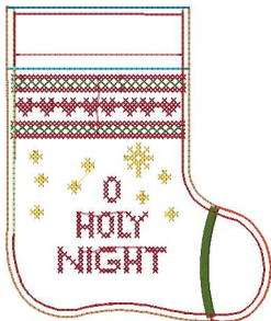
Omacmascstocking4.vip 5.00x6.00 inches; 9,636 stitches 12 thread changes; 10 colors