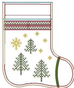
Omacmascstocking2.vip 5.00x6.00 inches; 9,763 stitches 12 thread changes; 10 colors