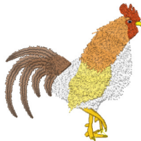
Country Chicken 2.vip

3.74x3.85 inches; 9,409 stitches 11 thread changes; 8 colors