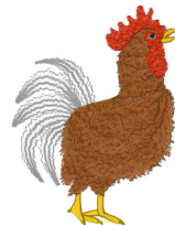
Country Chicken 6.vip

3.47x3.84 inches; 10,744 stitches 10 thread changes; 7 colors