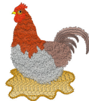
Country Chicken 3.vip

3.85x3.82 inches; 9,297 stitches 10 thread changes; 8 colors