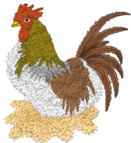
Country Chicken 4.vip

3.34x3.85 inches; 9,648 stitches 10 thread changes; 10 colors