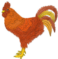
Country Chicken 1.vip

3.74x3.85 inches; 9,409 stitches 11 thread changes; 8 colors