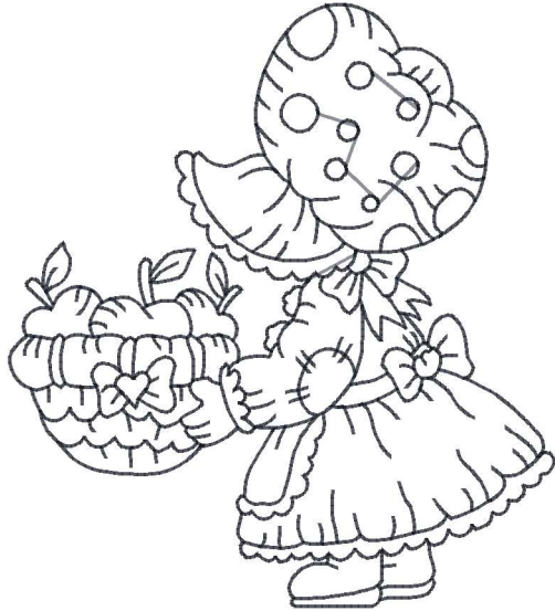
Ad200_summertime_redwork_03.vp3 5.01x5.55 inches; 3,977 stitches 1 thread changes; 1 colors