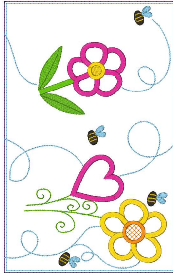
Design2.vip 6.31x9.84 inches; 16,105 stitches 18 thread changes; 8 colors