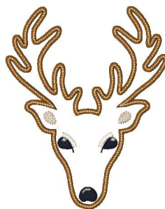
Deer Head 2.vip

5.01x6.28 inches; 6,217 stitches 3 thread changes; 3 colors