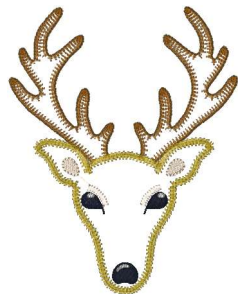
Deer Head 4.vip

5.01x6.28 inches; 5,303 stitches 3 thread changes; 3 colors