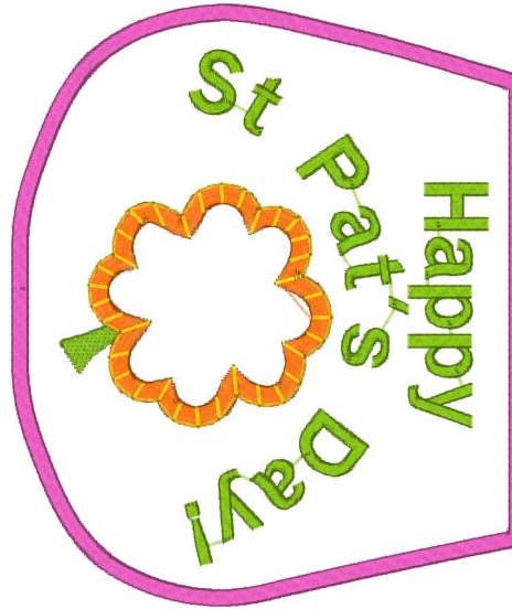
Ewc229_cloverbag.vip 4.94x5.80 inches; 10,539 stitches 8 thread changes; 8 colors