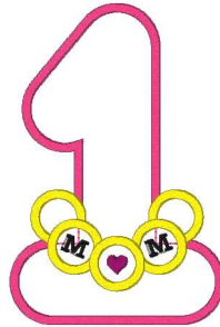
1 Mom Necklace 145.vp3 3.80x5.71 inches; 6,980 stitches 8 thread changes; 8 colors