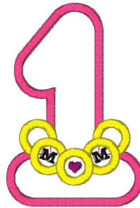
1 Mom Necklace 95.vp3 2.51x3.74 inches; 4,788 stitches 8 thread changes; 8 colors