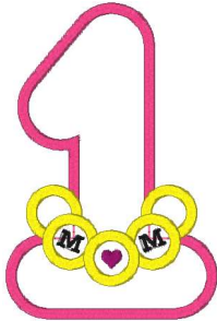
1 Mom Necklace 120.vp3 3.16x4.72 inches; 5,891 stitches 8 thread changes; 8 colors