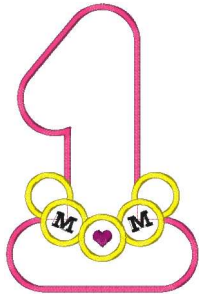
1 Mom Necklace 195.vp3 5.09x7.68 inches; 9,263 stitches 8 thread changes; 8 colors