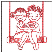
Boy And Girl On Swing-3in.vp3 2.95x2.95 inches; 2,670 stitches 2 thread changes; 2 colors