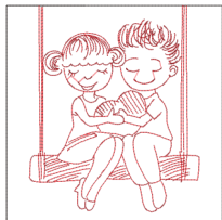
Boy And Girl On Swing-6in.vp3 6.22x6.22 inches; 4,862 stitches 2 thread changes; 2 colors