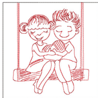
Boy And Girl On Swing-5in.vp3 5.04x5.04 inches; 4,102 stitches 2 thread changes; 2 colors