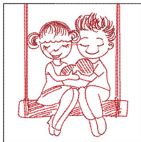
Boy And Girl On Swing-4in.vp3 3.86x3.86 inches; 3,365 stitches 2 thread changes; 2 colors