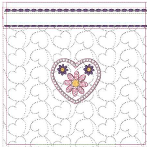
Omadaisyheartbagfront7x7.vip 7.02x7.00 inches; 10,942 stitches 16 thread changes; 9 colors