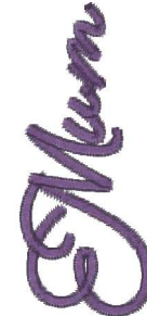
Omamum.vip 0.87x2.04 inches; 1,282 stitches 1 thread changes; 1 colors