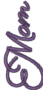
Omamom.vip 0.87x1.90 inches; 1,205 stitches 1 thread changes; 1 colors