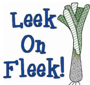
Towel_leek.vip 4.41x4.63 inches; 9,425 stitches 5 thread changes; 5 colors