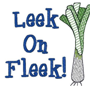
Towel_leek 4x4.vip 3.79x3.61 inches; 7,585 stitches 5 thread changes; 5 colors