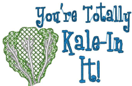
Towel_kale 4x4.vip 3.74x2.41 inches; 9,414 stitches 3 thread changes; 3 colors