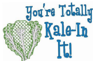
Towel_kale.vip 4.35x6.76 inches; 15,267 stitches 3 thread changes; 3 colors