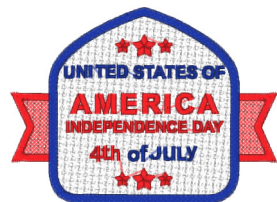
Fsl Badge 03.vip

3.37x2.78 inches; 8,956 stitches 7 thread changes; 3 colors