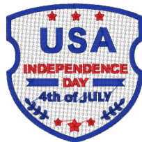
Fsl Badge 06.vip

3.43x3.13 inches; 7,678 stitches 3 thread changes; 3 colors