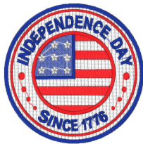
Fsl Badge 08.vip

3.43x2.53 inches; 8,951 stitches 8 thread changes; 3 colors