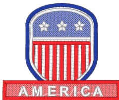
Fsl Badge 02.vip

3.76x3.26 inches; 10,439 stitches 3 thread changes; 3 colors