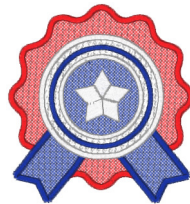
Fsl Badge 09.vip

3.89x3.90 inches; 16,144 stitches 5 thread changes; 3 colors