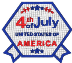
Fsl Badge 01.vip

3.76x3.26 inches; 10,439 stitches 3 thread changes; 3 colors