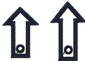
Clock Arms - 6x8.vip 2.07x1.48 inches; 1,498 stitches 6 thread changes; 3 colors