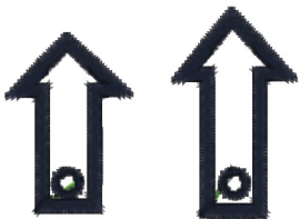
Clock Arms - 5x7.vip 1.76x1.28 inches; 1,314 stitches 6 thread changes; 3 colors