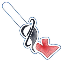
Ladyfashion3snaptab-Pa.vp3 3.74x3.69 inches; 2,567 stitches 4 thread changes; 4 colors