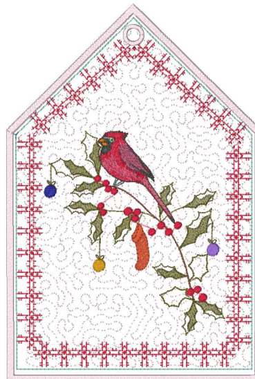
Bag-Side-1-6x10.vip 6.27x9.28 inches; 22,238 stitches 21 thread changes; 16 colors