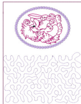
Part 1 Design 2.vip

6.09x7.83 inches; 8,903 stitches 10 thread changes; 7 colors