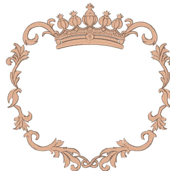
Monogram Design 02102024 6 Inch.vip 5.93x5.91 inches; 12,301 stitches 1 thread changes; 1 colors