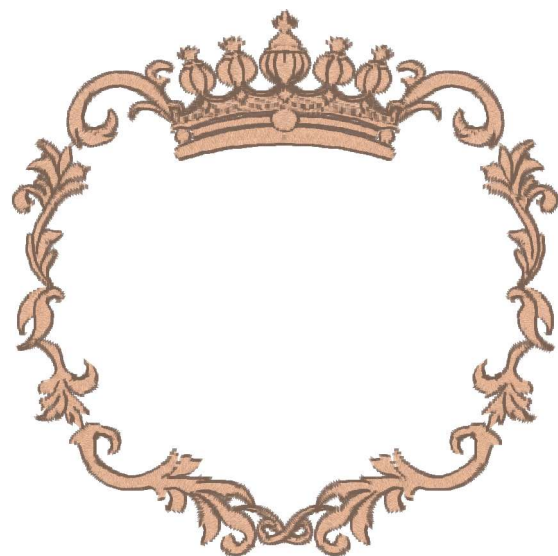
Monogram Design 02102024 4 Inch.vip 3.80x3.79 inches; 7,911 stitches 1 thread changes; 1 colors