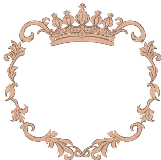
Monogram Design 02102024 7inch.vip 6.91x6.90 inches; 14,392 stitches 1 thread changes; 1 colors