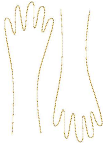
Spa Back Legs 8x8.vp3 4.88x7.06 inches; 2,333 stitches 2 thread changes; 2 colors