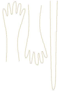
Spa Back Legs 6x10.vp3 6.01x9.91 inches; 3,305 stitches 2 thread changes; 2 colors