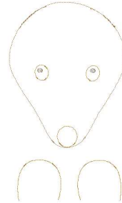
Spa- Oposum Face 6x10.vp3 5.61x9.69 inches; 2,900 stitches 14 thread changes; 3 colors