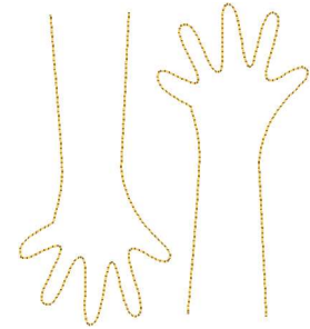
Spa-Front Legs 8x8.vp3 4.85x5.42 inches; 1,824 stitches 2 thread changes; 2 colors