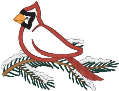
Winter Cardinal 120.vp3 4.72x3.59 inches; 15,311 stitches 11 thread changes; 11 colors