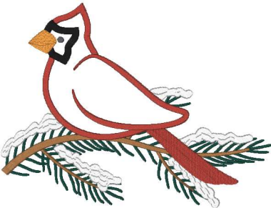
Winter Cardinal 195.vp3 7.68x5.78 inches; 25,670 stitches 11 thread changes; 11 colors