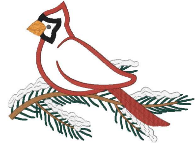
Winter Cardinal 170.vp3 6.69x5.05 inches; 22,198 stitches 11 thread changes; 11 colors