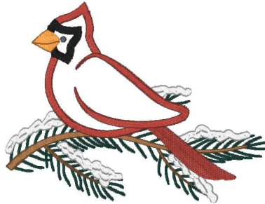
Winter Cardinal 145.vp3 5.71x4.31 inches; 18,483 stitches 11 thread changes; 11 colors