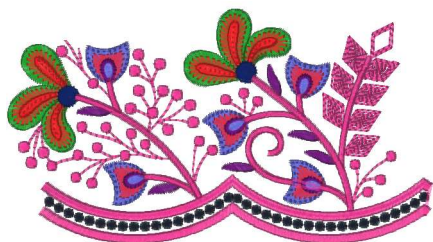
1 A- S.vip

2.88x9.94 inches; 19,212 stitches 7 thread changes; 7 colors