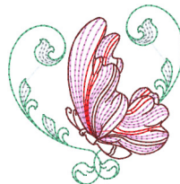
Spring-Baroque-09-4x4.vip 3.75x3.85 inches; 5,070 stitches 5 thread changes; 5 colors