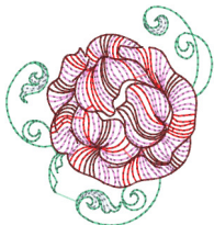
Spring-Baroque-08-4x4.vip 3.61x3.85 inches; 6,567 stitches 5 thread changes; 5 colors