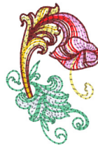
Spring-Baroque-05-3x3.vip 1.94x2.89 inches; 4,961 stitches 7 thread changes; 7 colors