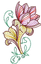
Spring-Baroque-06-4x4.vip 2.48x3.85 inches; 4,685 stitches 6 thread changes; 6 colors