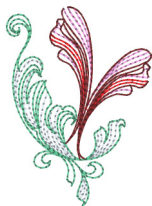
Spring-Baroque-07-4x4.vip 2.79x3.85 inches; 4,249 stitches 5 thread changes; 5 colors