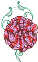
Spring-Baroque-10-3x3.vip 1.83x3.00 inches; 5,992 stitches 5 thread changes; 5 colors