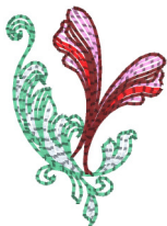
Spring-Baroque-07-3x3.vip 1.63x2.26 inches; 2,770 stitches 5 thread changes; 5 colors