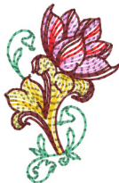
Spring-Baroque-06-3x3.vip 1.64x2.55 inches; 3,390 stitches 6 thread changes; 6 colors