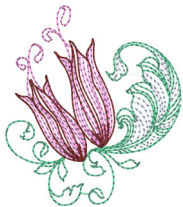
Spring-Baroque-02-4x4.vip 3.37x3.85 inches; 5,718 stitches 4 thread changes; 4 colors