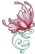
Spring-Baroque-03-4x4.vip 2.48x3.85 inches; 4,511 stitches 5 thread changes; 5 colors