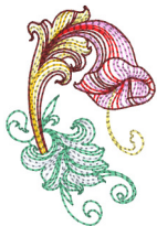
Spring-Baroque-05-4x4.vip 2.58x3.85 inches; 6,107 stitches 7 thread changes; 7 colors