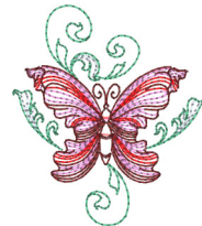
Spring-Baroque-12-4x4.vip 3.39x3.85 inches; 6,048 stitches 5 thread changes; 5 colors