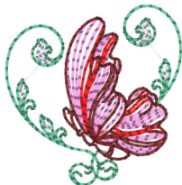
Spring-Baroque-09-3x3.vip 2.02x2.07 inches; 3,171 stitches 5 thread changes; 5 colors