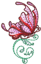
Spring-Baroque-03-3x3.vip 1.72x2.66 inches; 3,449 stitches 5 thread changes; 5 colors