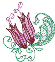
Spring-Baroque-02-3x3.vip 2.19x2.51 inches; 4,054 stitches 4 thread changes; 4 colors