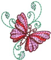
Spring-Baroque-04-3x3.vip 2.13x2.53 inches; 4,025 stitches 5 thread changes; 5 colors