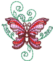
Spring-Baroque-12-3x3.vip 2.26x2.56 inches; 4,452 stitches 5 thread changes; 5 colors