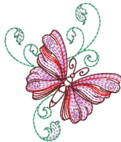
Spring-Baroque-04-4x4.vip 3.25x3.85 inches; 5,626 stitches 5 thread changes; 5 colors