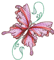
Spring-Baroque-01-4x4.vip 3.48x3.84 inches; 6,766 stitches 5 thread changes; 5 colors