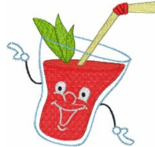
Iced Tea & Lemonade 9 4x4.vip 3.85x3.67 inches; 6,704 stitches 8 thread changes; 7 colors