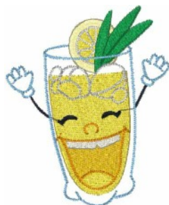
Iced Tea & Lemonade 4 4x4.vip 3.13x3.85 inches; 7,994 stitches 9 thread changes; 9 colors