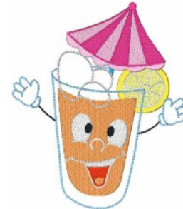
Iced Tea & Lemonade 10.vip 5.08x5.93 inches; 16,497 stitches 12 thread changes; 11 colors