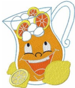
Iced Tea & Lemonade 1.vip 5.01x6.00 inches; 22,170 stitches 10 thread changes; 9 colors