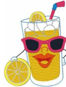
Iced Tea & Lemonade 7.vip 5.04x6.73 inches; 23,029 stitches 11 thread changes; 10 colors