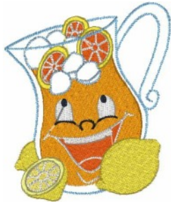
Iced Tea & Lemonade 1 4x4.vip 3.22x3.86 inches; 11,299 stitches 10 thread changes; 9 colors