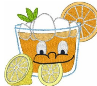
Iced Tea & Lemonade 3 4x4.vip 3.85x3.38 inches; 12,050 stitches 10 thread changes; 10 colors