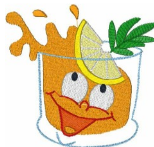
Iced Tea & Lemonade 5 4x4.vip 3.85x3.61 inches; 10,444 stitches 9 thread changes; 9 colors