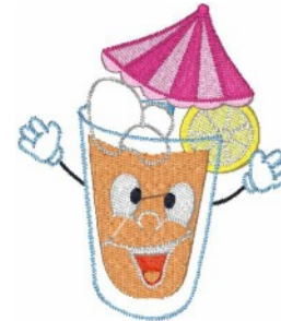
Iced Tea & Lemonade 10 4x4.vip 3.31x3.86 inches; 8,596 stitches 12 thread changes; 11 colors