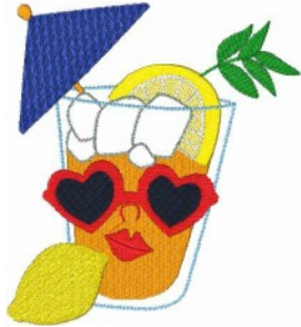
Iced Tea & Lemonade 6.vip 5.03x5.53 inches; 18,957 stitches 12 thread changes; 10 colors