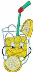
Iced Tea & Lemonade 2 4x4.vip 1.73x3.86 inches; 5,687 stitches 13 thread changes; 10 colors