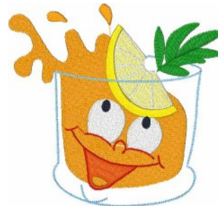
Iced Tea & Lemonade 5.vip 5.02x4.71 inches; 15,974 stitches 9 thread changes; 9 colors