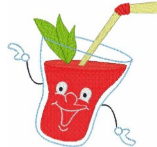
Iced Tea & Lemonade 9.vip 5.05x4.81 inches; 10,709 stitches 8 thread changes; 7 colors