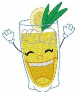
Iced Tea & Lemonade 4.vip 5.06x6.25 inches; 16,778 stitches 9 thread changes; 9 colors