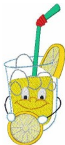
Iced Tea & Lemonade 2.vip 3.01x6.98 inches; 12,580 stitches 13 thread changes; 10 colors