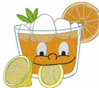
Iced Tea & Lemonade 3.vip 5.01x4.40 inches; 18,197 stitches 10 thread changes; 10 colors