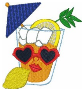
Iced Tea & Lemonade 6 4x4.vip 3.52x3.87 inches; 10,324 stitches 12 thread changes; 10 colors