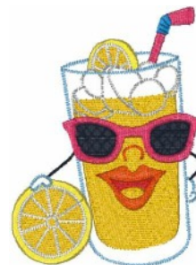
Iced Tea & Lemonade 7 4x4.vip 2.89x3.85 inches; 9,259 stitches 11 thread changes; 10 colors