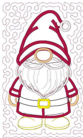
Wix.vip 6.00x10.00 inches; 20,800 stitches 26 thread changes; 7 colors