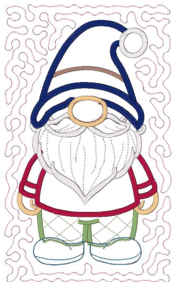
Tonk.vip 6.00x9.99 inches; 21,485 stitches 29 thread changes; 10 colors