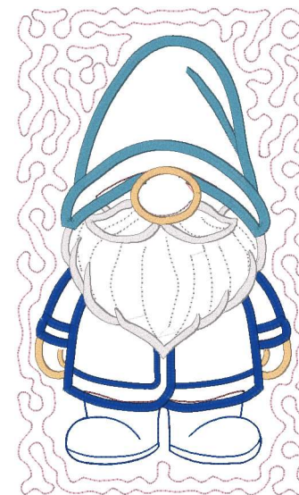
Rosco.vip 6.00x10.00 inches; 19,992 stitches 20 thread changes; 7 colors