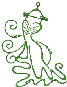
Bbe_wedding Dress 02 5x7.vp3 4.80x6.22 inches; 10,393 stitches 1 thread changes; 1 colors