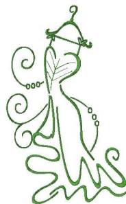
Bbe_wedding Dress 02 6x10.vp3 5.76x9.45 inches; 13,820 stitches 1 thread changes; 1 colors