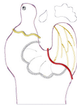
Part 2 Chick Chick 8x11.vip 7.81x10.81 inches; 8,091 stitches 22 thread changes; 9 colors