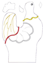
Part 1 Chick Chick 8x12.vip 7.82x11.75 inches; 7,520 stitches 23 thread changes; 9 colors