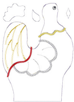
Part 1 Chick Chick 8x11.vip 7.81x10.81 inches; 7,470 stitches 23 thread changes; 9 colors