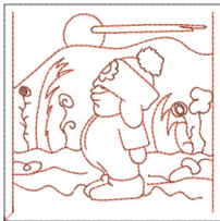
B-Christmas-Girl-Dressed-For-Winter - 4in.vip 3.94x3.94 inches; 2,563 stitches 2 thread changes; 2 colors