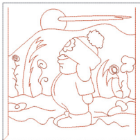
B-Christmas-Girl-Dressed-For-Winter - 7in.vip 7.09x7.09 inches; 3,913 stitches 2 thread changes; 2 colors