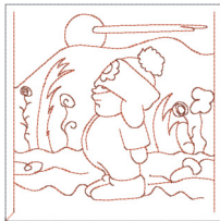
B-Christmas-Girl-Dressed-For-Winter - 5in.vip 5.12x5.12 inches; 3,075 stitches 2 thread changes; 2 colors