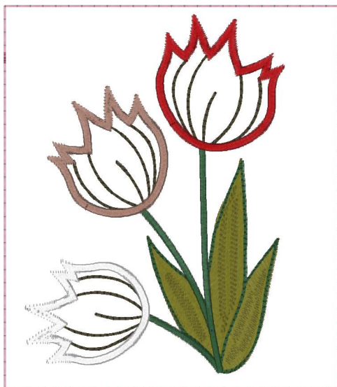
Jacobean V 6.vip 4.96x5.66 inches; 8,142 stitches 13 thread changes; 9 colors