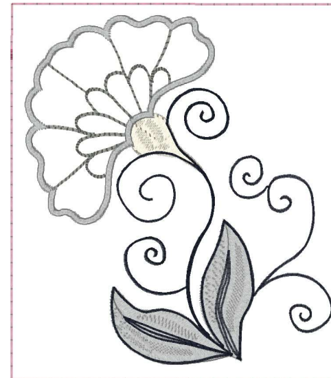
Jacobean 2 V 6.vip 4.97x5.66 inches; 7,721 stitches 8 thread changes; 7 colors