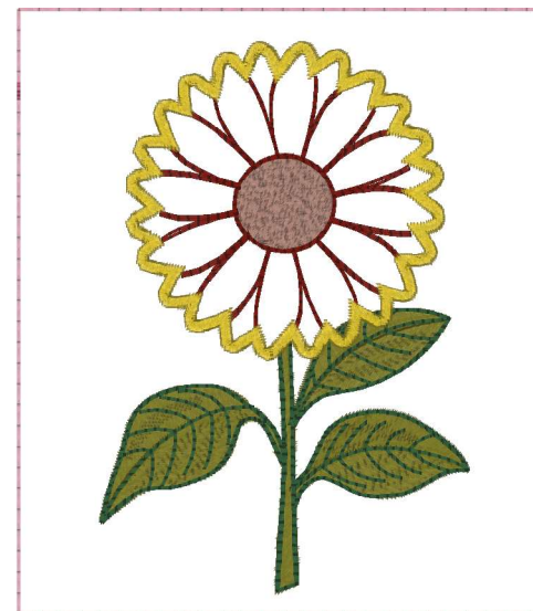
Sunflower V 6.vip 4.96x5.65 inches; 9,653 stitches 8 thread changes; 8 colors