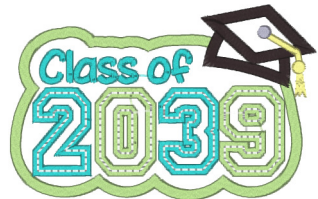
Ca-Class Of 2039-5in.vip

3.92x2.50 inches; 8,878 stitches 17 thread changes; 8 colors