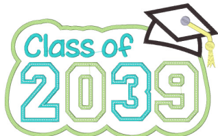
Ca-Class Of 2039-11in.vip

9.76x6.20 inches; 21,526 stitches 17 thread changes; 8 colors