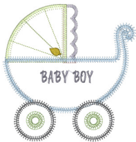
Baby Carriage 4.vip

5.27x5.60 inches; 11,100 stitches 20 thread changes; 18 colors