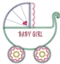
Baby Carriage 3.vip

5.31x5.57 inches; 13,193 stitches 24 thread changes; 18 colors