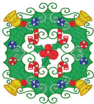
Rlmed Christmas Ornaments 6 A.vip 3.57x3.91 inches; 20,084 stitches 9 thread changes; 7 colors