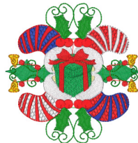
Rlmed Christmas Ornaments 2 A.vip 3.81x3.90 inches; 17,011 stitches 14 thread changes; 8 colors