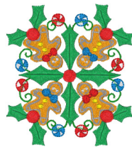
Rlmed Christmas Ornaments 8 A.vip 3.54x3.93 inches; 20,449 stitches 8 thread changes; 7 colors