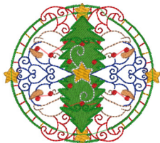
Rlmed Christmas Ornaments 3 A.vip 3.89x3.47 inches; 10,924 stitches 9 thread changes; 8 colors