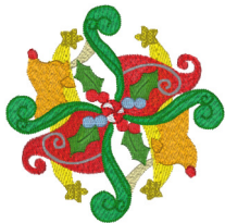
Rlmed Christmas Ornaments 9 A.vip 3.80x3.78 inches; 15,796 stitches 10 thread changes; 9 colors