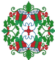
Rlmed Christmas Ornaments 4 A.vip 3.49x3.89 inches; 12,456 stitches 7 thread changes; 5 colors