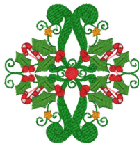
Rlmed Christmas Ornaments 7a.vip 3.68x3.78 inches; 13,840 stitches 7 thread changes; 5 colors