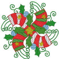
Rlmed Christmas Ornaments 10a.vip 3.78x3.75 inches; 13,601 stitches 8 thread changes; 6 colors