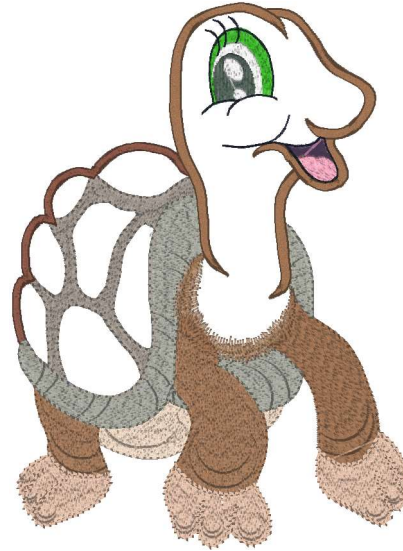
Oae006_set2_11.vip 5.72x7.90 inches; 27,026 stitches 18 thread changes; 17 colors