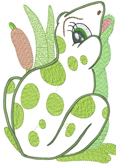
Oae006_set2_8.vip 5.56x7.79 inches; 26,285 stitches 14 thread changes; 14 colors