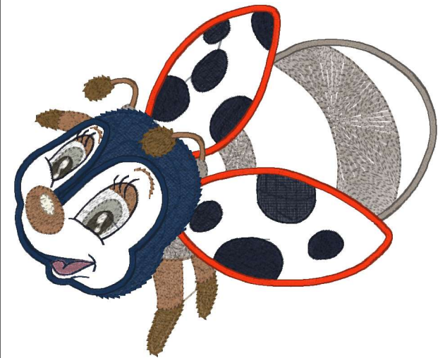
Oae006_set2_9.vip 7.52x6.25 inches; 25,429 stitches 26 thread changes; 18 colors