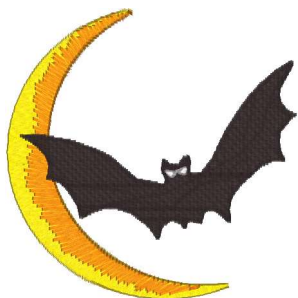
The Bat And The Moon.vip 2.98x2.98 inches; 3,680 stitches 4 thread changes; 4 colors