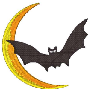
The Bat And The Moon100.vip 3.85x3.85 inches; 6,867 stitches 4 thread changes; 4 colors