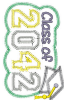
Ca-Zigzag Class Of 2042 -6in.vip 3.60x5.82 inches; 5,115 stitches 15 thread changes; 7 colors