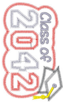
Ca-Zigzag Class Of 2042 -7in.vip 4.19x6.80 inches; 5,921 stitches 15 thread changes; 6 colors