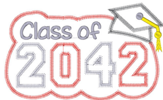
Ca-Zigzag Class Of 2042 -9in.vip 8.74x5.39 inches; 7,619 stitches 15 thread changes; 6 colors