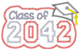
Ca-Zigzag Class Of 2042 -8in.vip 7.77x4.80 inches; 6,822 stitches 15 thread changes; 6 colors