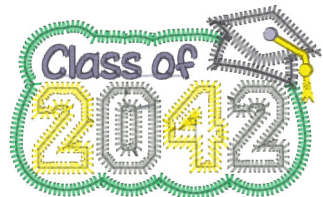
Ca-Zigzag Class Of 2042 -4in.vip 3.87x2.42 inches; 3,451 stitches 15 thread changes; 7 colors