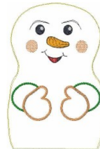
Main Part 8x12.vip>MK662VIP.zip 7.81x11.74 inches; 12,056 stitches 20 thread changes; 8 colors