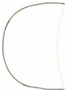
Beanie.vip>MK662VIP.zip 5.36x7.45 inches; 661 stitches 2 thread changes; 2 colors