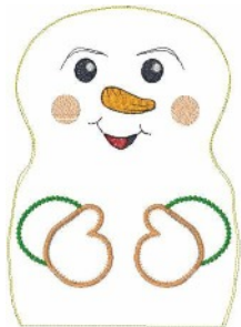
Main Part 8x11.vip>MK662VIP.zip 7.81x10.80 inches; 11,961 stitches 20 thread changes; 8 colors