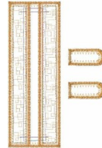
M 220220c vip

5.51x7.87 inches; 11,878 stitches 4 thread changes; 4 colors