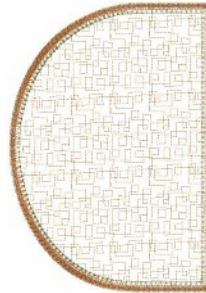
M 220220b vip

5.51x7.87 inches; 13,663 stitches 5 thread changes; 4 colors